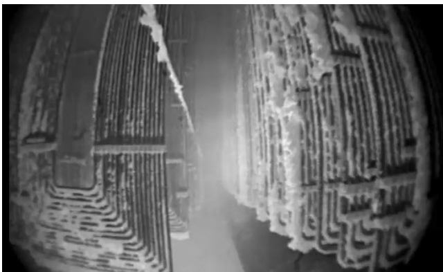
View of the superheater from the Diamond Power UtiliCam AT IV camera system.

The UtiliCam AT IV infrared camera system reduces maintenance hours as compared to conventional older style lens tube camera systems. The newly designed optical probe has encased optics that are keyed for correct position internal to probes and has no loose components which could fall out and break during cleaning. There are minimal parts to handle, and each optical probe is environmentally sealed for maximum protection and shock resistance.