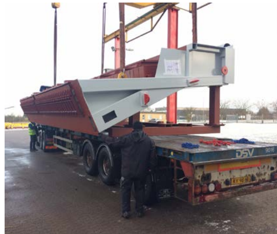
The DynaFeeder fuel feeder is available for new boiler installations or as a retrofit upgrade on existing units.