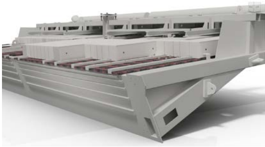
Changeable wear plates on feeder rams lower maintenance costs