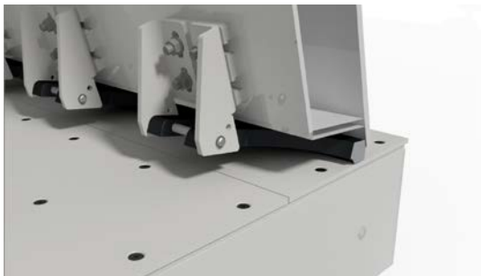
Feeder scrapers inhibit waste buildup behind rams