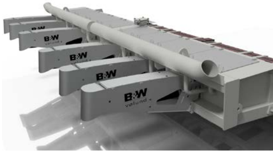
Hydraulic cylinder location outside feeder mechanism avoids exposure to heat