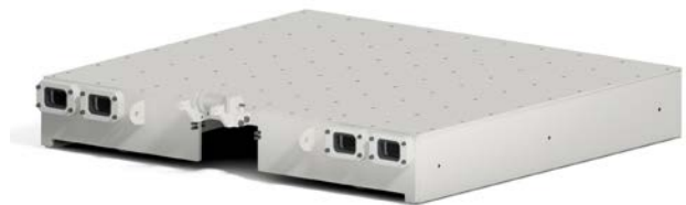
Cooling air pipes with cast wear bushings for reduced maintenance