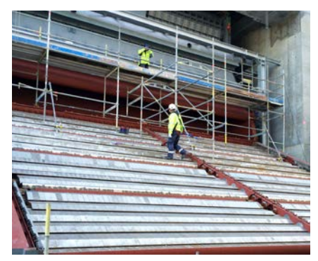
Installation of two 35 tonne per hour DynaGrate combustion grates at CopenHill, Denmark.

With the DynaGrate technology we can meet the rigorous demands for waste-fired plants, which require a high level of accessibility, fuel flexibility, and energy recovery, under environmentally sound conditions.